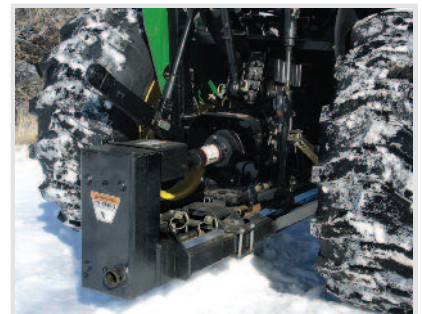
The efficient transfer case transfers power from the rear PTO to the front mounted snowblower.

We offer several different widths from 60" to 108", all of which are true quick attach systems that allow easy on/off attachment in approximately 5 minutes. Standard features include hydraulic lift and chute rotation, bolt-on cutting edge, and adjustable skid shoes. These ruggedly built Erskine snowblowers are second to none in features, performance, and durability.