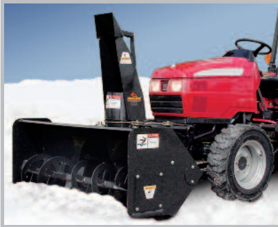
Fits all tractors with or without front loader mounting bracket.