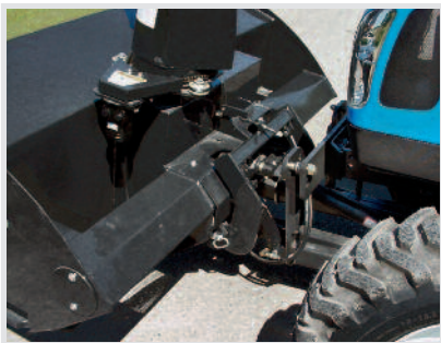
The Erskine Quick Attach Mounting System allows for easy attachment and removal of blower unit.